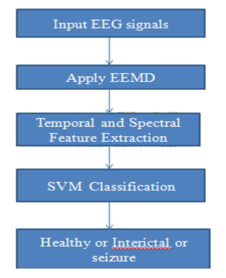
Fig 1.2 Flow Diagram of Proposed Work

instead of taking third order IMF's as in the case of EMD. <sup>4</sup>. After that a Hilbert transform is applied to the signal for feature extraction. The temporal feature and spectral features like mean, variance, Skewness and spectral 5. centroid, variance coefficient and spectral skew is calculated correspondingly. The calculated features are fed into SVM classifier. Finally, the output is displayed as Healthy, Pre-Seizure or Seizure accordingly.